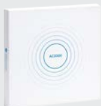
AC2000 AC2000 Airport AC2000 Lite