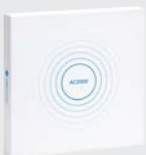
AC2000 AC2000 Airport AC2000 Lite