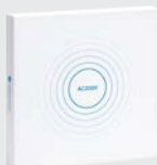
AC2000 AC2000 Airport AC2000 Lite